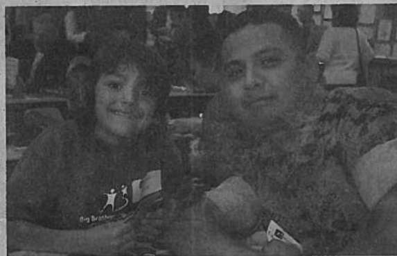
Our Operation Bigs Program provides mentoring for military children with a deployable parent.

Big Brothers Big Sisters salutes our veterans by upholding their legacy and mentoring tomorrow's heroes.