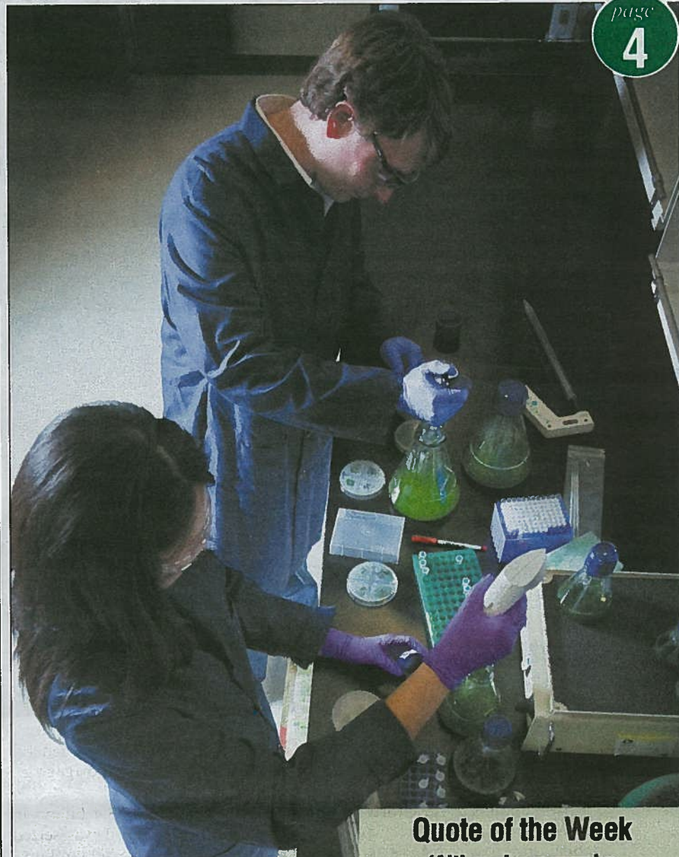
With a boost of $104.5 million in federal funds, Sapphire Energy plans to build a biofuel operation in New Mexico where it would grow algae in ponds to be refined into fuels.

Quote of the Week 'Although we may be technically out of a recession, employers aren't convinced that we're out, and until they're convinced the recession is really over, they're going to hold back from hiring.'