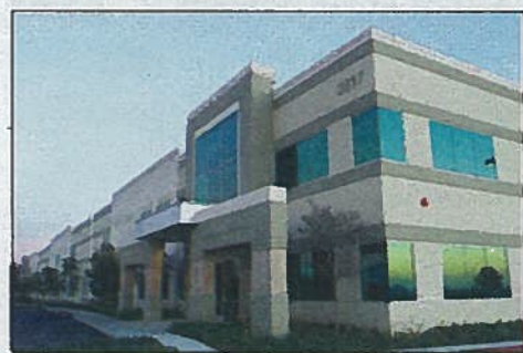
DEI purchased the La Pacifica industrial project, which is 80 percent leased.