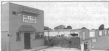
Five Star Storage, Vallejo