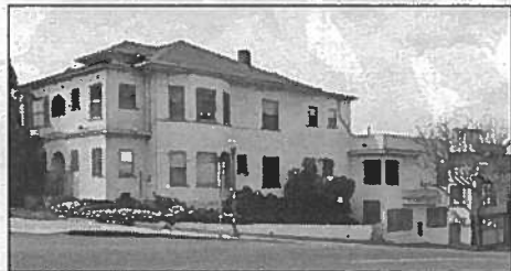
2231 Broadway, San Diego